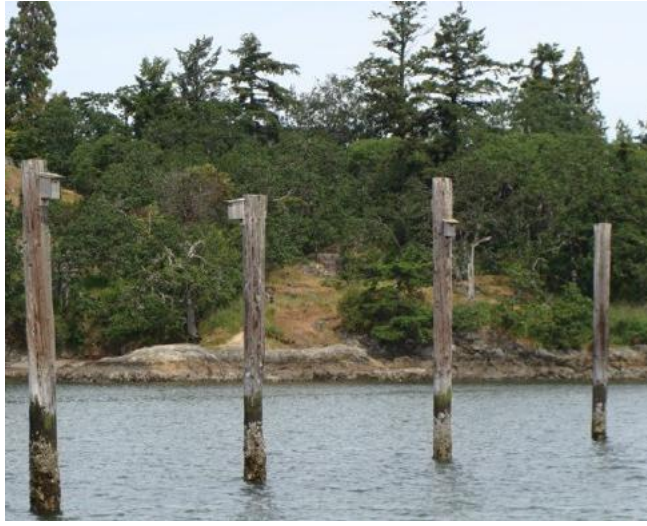
Purple Martin Houses - Even some purple martins have their homes on the water in West Bay.