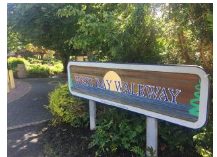
West Bay Walkway -The West Bay Walkway is a walking path and boardwalk that connects Esquimalt (from Head Street at Sailor's Cove Marina) to downtown Victoria (Johnston Street Bridge). It was built as a joint project with the Provincial Capital Commission and the City of Victoria. The pathway is approximately 5 km and connects with Victoria's Westsong Walkway.