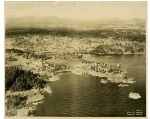
Early West Bay photo