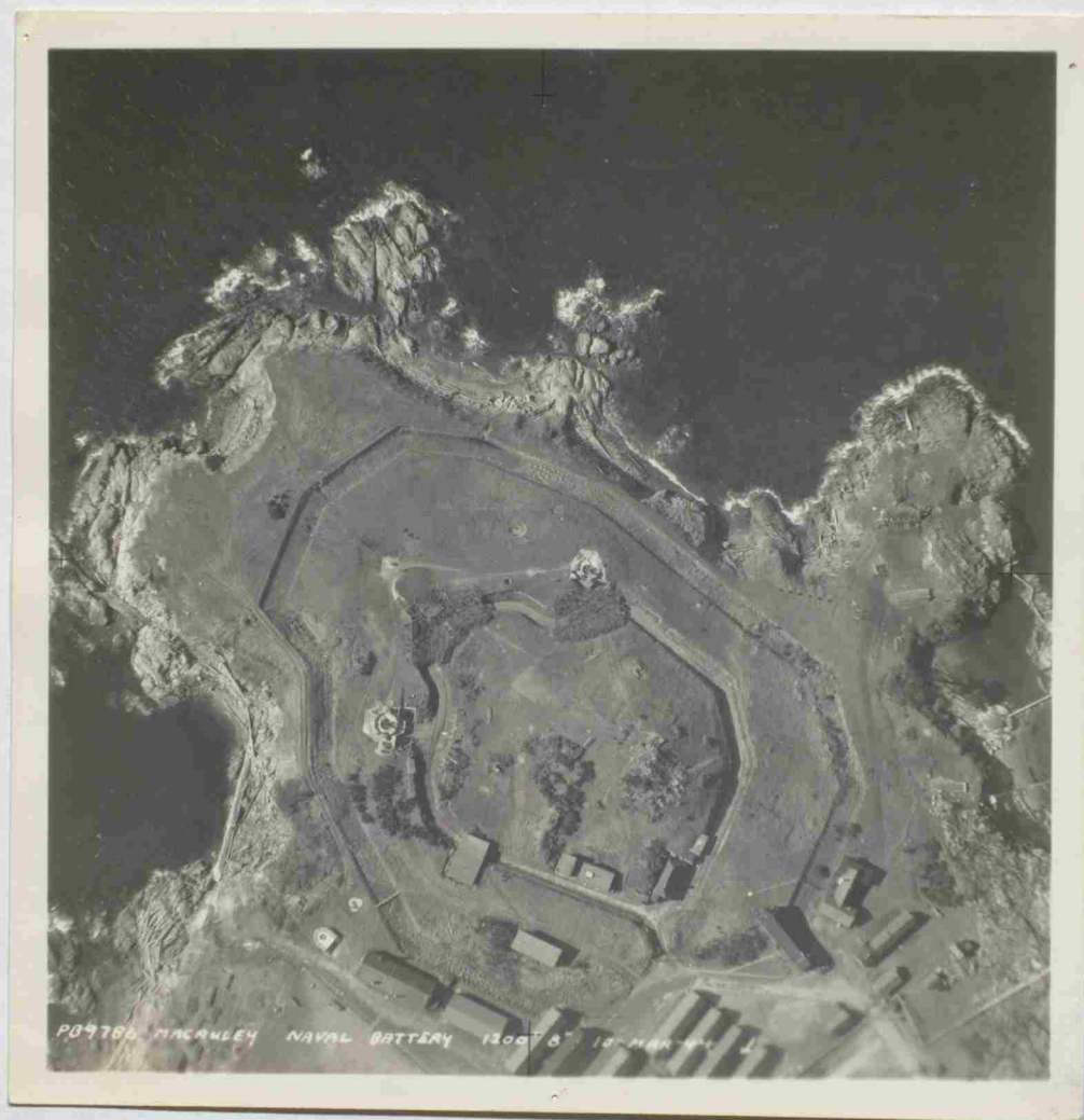
PG 766 MACANLEY NAVAL BATTERY 1300' 8" 18 MAR 1911