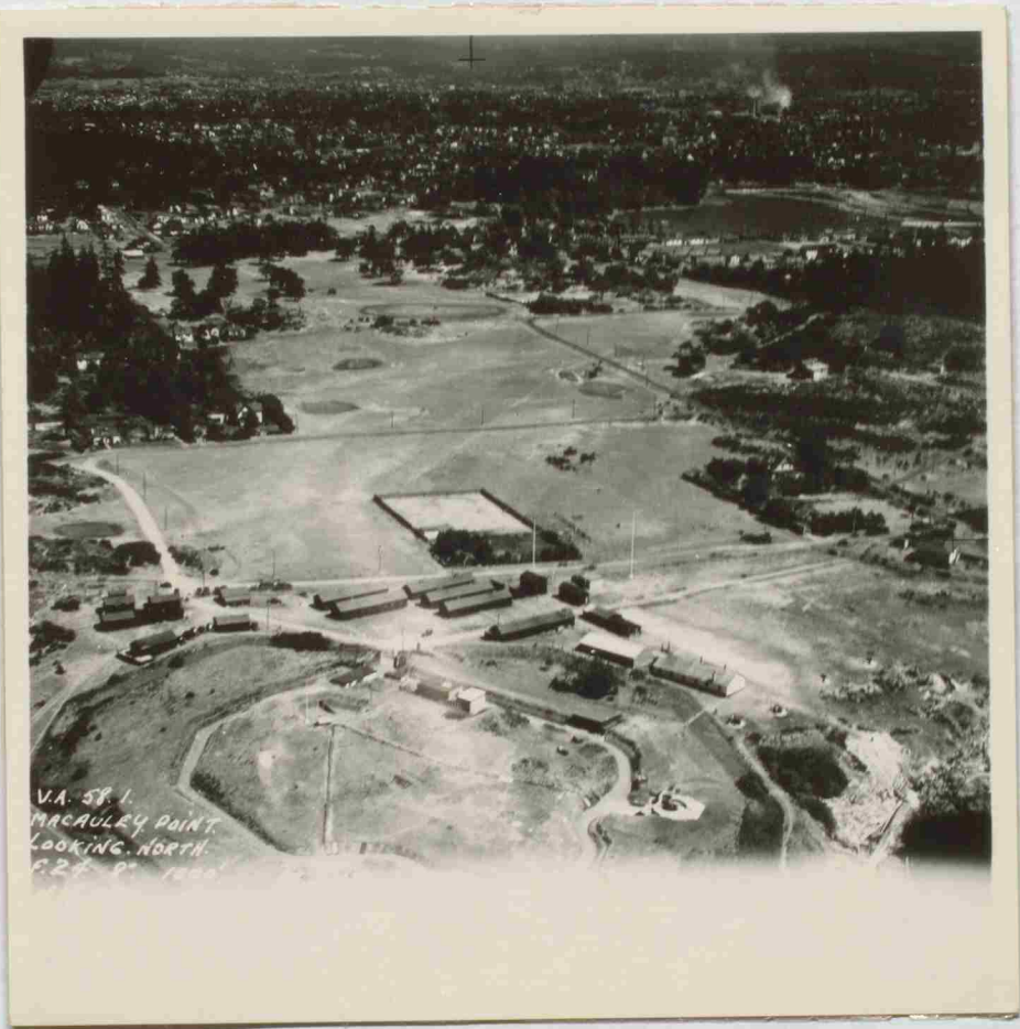
V.A. 581 MACAULAY POINT LOOKING NORTH 6.24.66